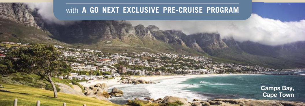
Camps Bay, Cape Town

with A GO NEXT EXCLUSIVE PRE-CRUISE PROGRAM