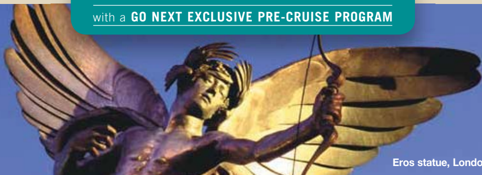
Eros statue, London

Discover the highlights of London that you might otherwise miss. This carefully crafted program includes an ideally located hotel, specially arranged sightseeing tours featuring cultural and historical sites, transfers (as noted below), professional guides, and exceptional concierge support from an on-location Go Next Program Manager.