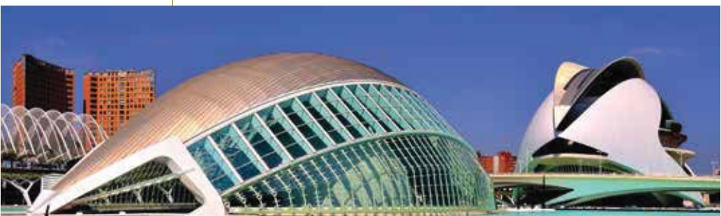
City of Arts and Sciences, Valencia

Oceania Cruises may modify the cruise itinerary up to and during the voyage. Air arrangements, cruise accommodations, local transportation, and optional shore excursions are arranged by Oceania Cruises, which may use other suppliers or providers to render the services. The agreement in this brochure is the exclusive and entire statement of the agreement between you and Go Next, Inc. It should be read carefully.