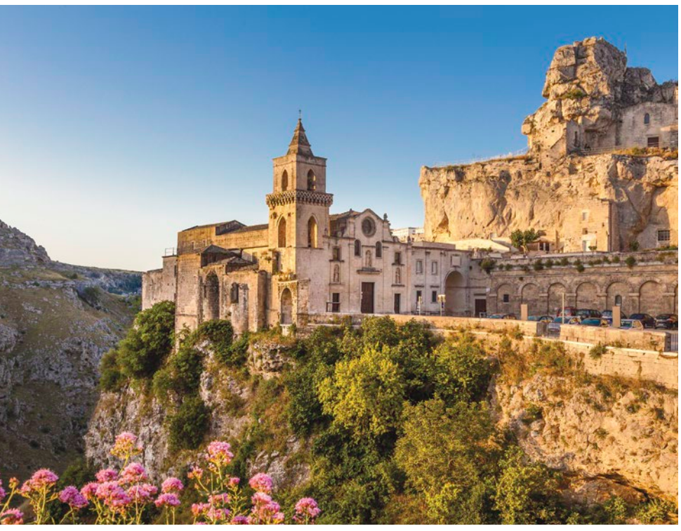
Sassi di Matera

Trani. Explore the historic seaport of Trani. Known for its Moscato di Trani wine and savory figs, this fishing town is home to a 13th-century fort and a cathedral nestled in the harbor of the Adriatic. Take note of the distinguishing Norman houses, a typically English-Romanesque style of architecture.