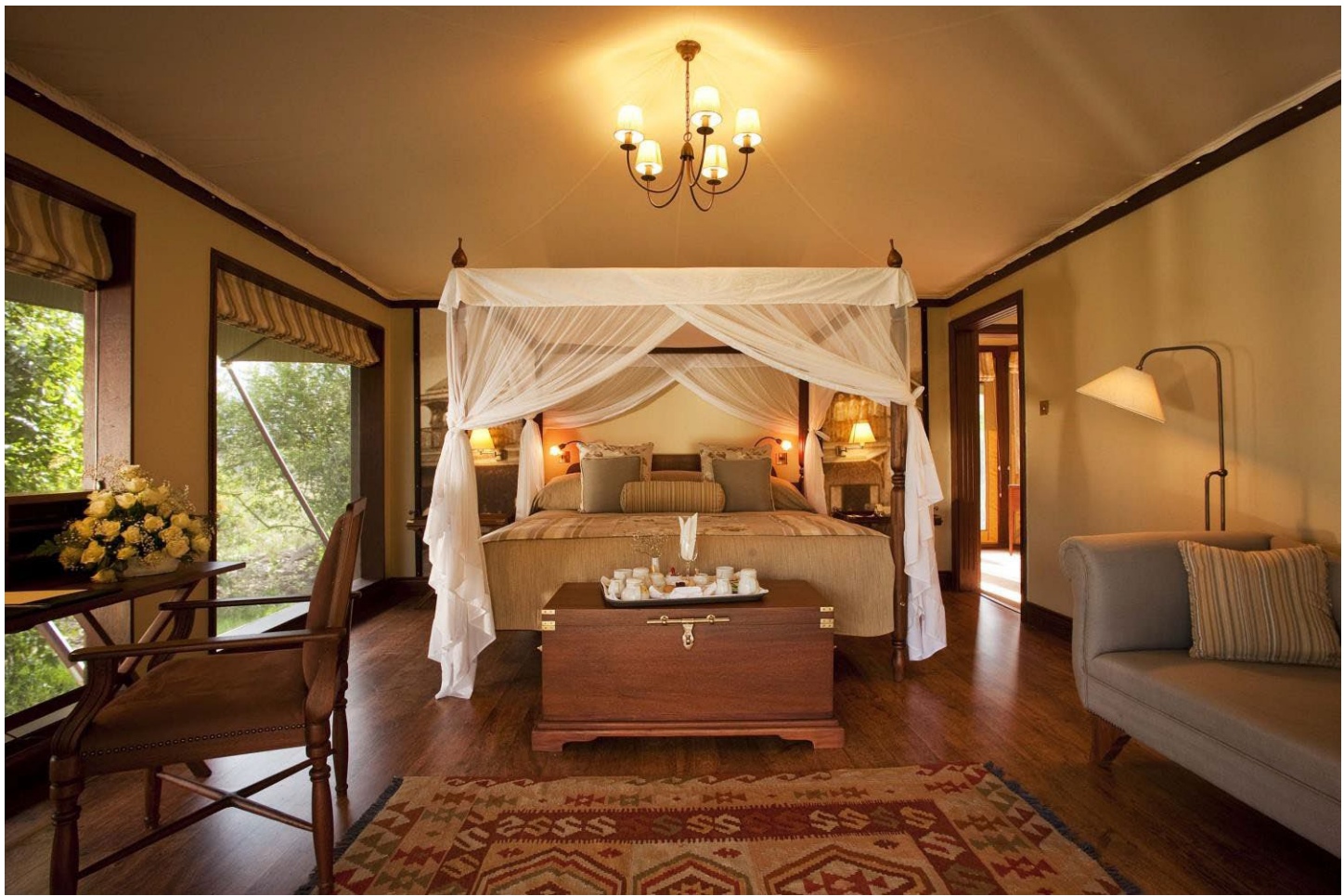
Lake Elmenteita Tented Camp

On safari in Kenya, you can expect excellent accommodations - Hotel/lodge and deluxe, safari style camping; great food with many choices served buffet style; some picnic lunches; light walking; a few long drives up to six hours at times which can be on some uneven, bumpy roads, sometimes muddy, however, will always include wildlife viewing when moving from one park to the next; some dust; morning and afternoon game drives each day; and cool mornings and evenings with warm days. One must be able to climb (step on and down) in and out of a safari 4x4 vehicle and in and out of a small aircraft. One should be in good physical condition, remain flexible, be of good humor, and have a spirit of adventure and curiosity to enjoy this safari to its fullest.