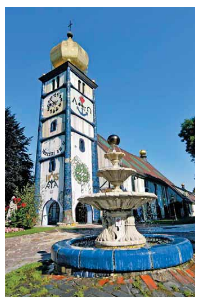
St. Barbara Church, Bärnbach