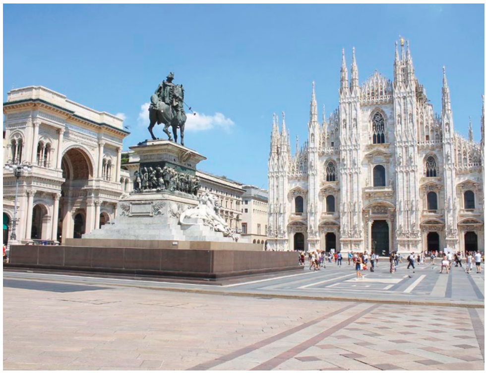
Piazza del Duomo, Milan

Cruising Lake Como. Travel by private boat from Bellagio to Como, one of the most romantic ways to experience this region. Glide on deep-blue water, gloriously bathed with rays of sunlight, and delight in views of villas and colorful villages. Vistas of stunning gardens, hidden waterfalls and cypress groves will captivate your senses while the majestic Alps stand sentry from afar. Upon arrival in Como, join your guide for a walking tour. Pass by Piazza Cavour, viewing the elegant gardens and the historic Teatro Adriano.