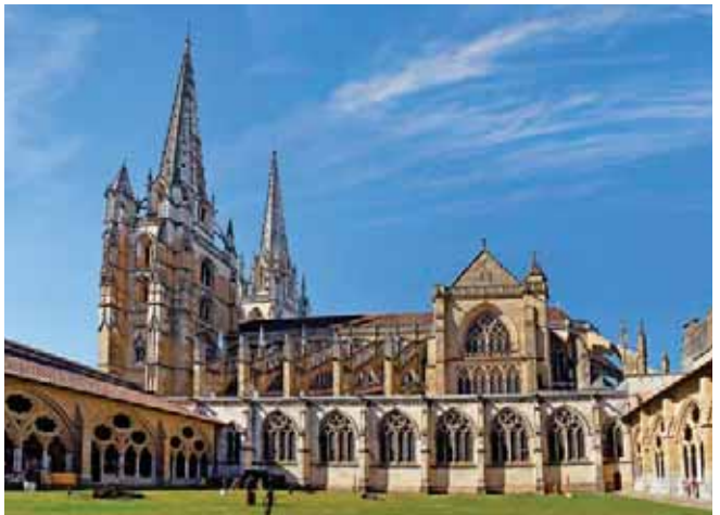
Right: Sainte-Marie Cathedral