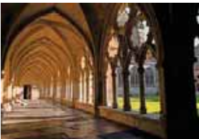
Above: Cloister of Sainte-Marie Cathedral, Bayonne