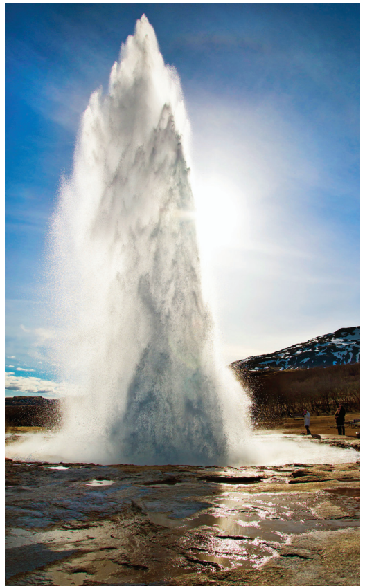
Iceland's hot spring geysers are famous natural attractions.

parliament founded here in 930 CE, and walk along a gorge into the rift valley itself. After a lunch of wild freshwater trout at a lakeside hotel, we depart for famed Great Geysir and Gullfoss, Iceland's immensely popular "golden" waterfall with its spectacular two-tiered cataract. Then we drive down to the southern coast to the beautiful agricultural area of Selfoss. B,L