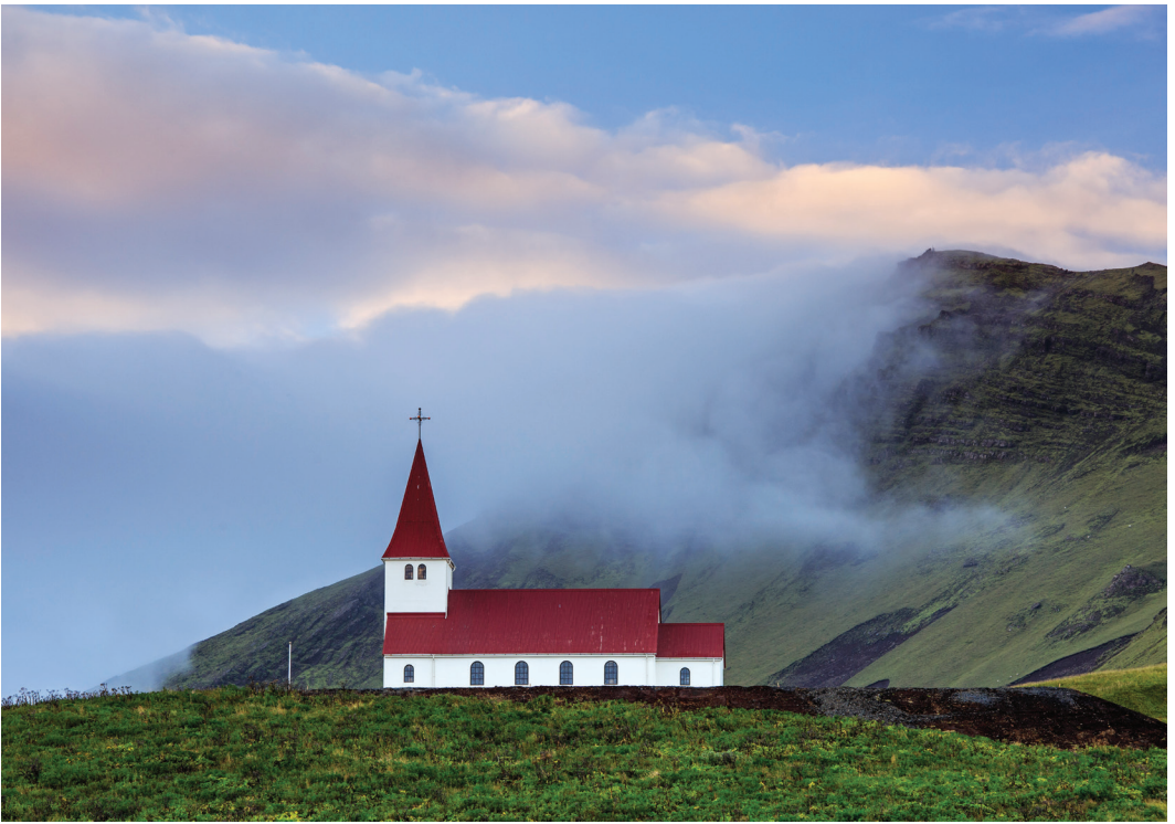
The church in Vik sits high on a hill, offering scenic views of the ocean and town.

Day 5: Akureyri/Lake Myvatn Today we travel to beautiful Lake Myvatn. One of the world's natural wonders, Lake Myvatn and its environs of bubbling mud flats, lava fields, and lunar-like volcanic craters comprise a stunningly beautiful national park. Our explorations begin with a walk up to the fascinating Hverfjall crater, a local landmark. Later we see the region's unique "pseudo craters," the boiling mud pots at Namaskard, the bizarre lava formations at Dimmuborgir, and the flat volcano system at Krafla. Our last stop is the incredible Glacial River Canyon National Park, yet another of Iceland's natural wonders, where we walk to jaw-dropping Dettifoss, Europe's most powerful waterfall and Iceland's "Niagara." After this day of stunning scenery, we return to our hotel in time for dinner on our own tonight. B,L