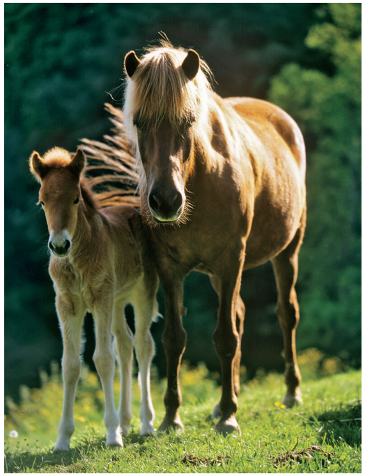
On Day 4 we visit a farm featuring famed Icelandic horses.