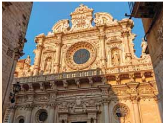
Basilica di Santa Croce, Lecce

Enrichment: History & Architecture of Lecce & Ostuni. Learn about this region's fascinating history and unique architectural styles.