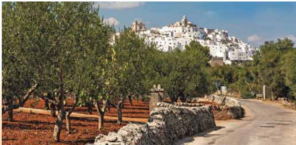
Ostuni, "The White City"

Visit a family-run olive mill in the sun-baked countryside. Learn about the history and cultivation process of olives. Unwind over lunch and gather with the mill's employees or owners to discuss life in Italy.