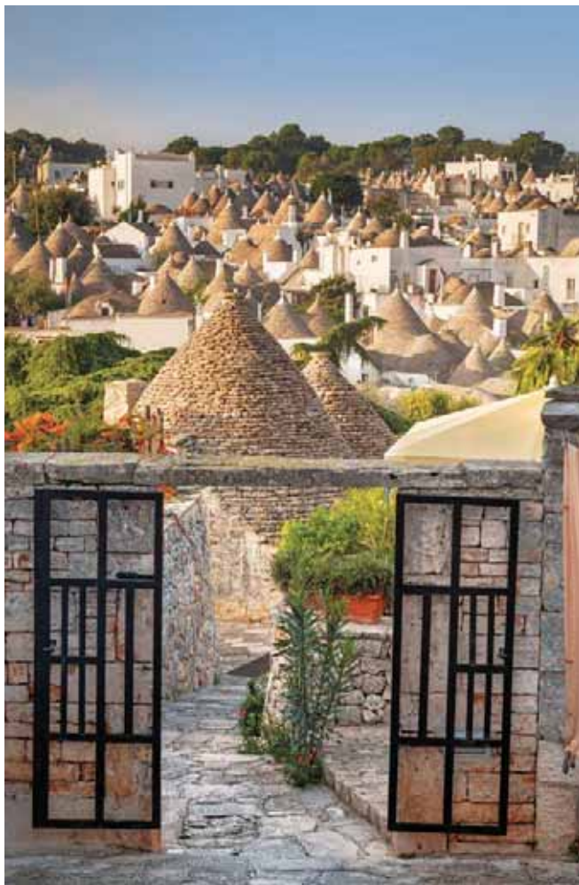
Trulli of Alberobello