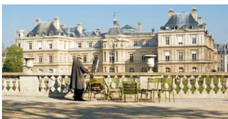
Top: Champs-Élysées | Above: Gardens in Latin Quarter