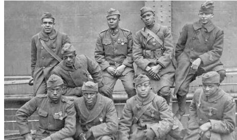
Soldiers of the 369th Infantry, the Harlem Hellfighters

Since the 1920s, Paris has welcomed African-American writers, who have used the distance to reflect upon life, politics and culture in the U.S.