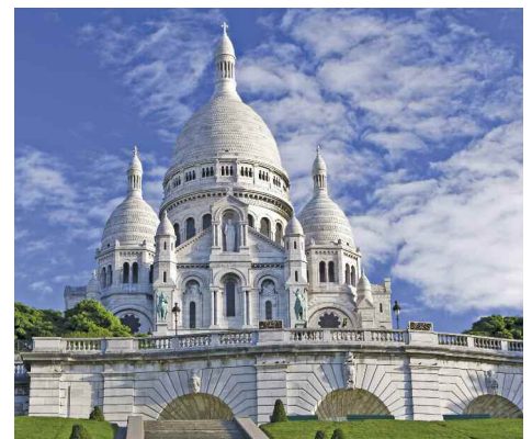
Sacré-Cœur in Montmartre