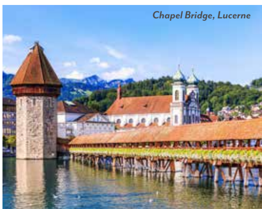
Chapel Bridge, Lucerne