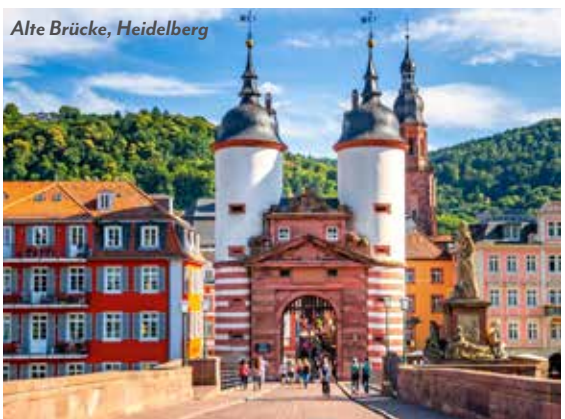
Alte Brücke, Heidelberg