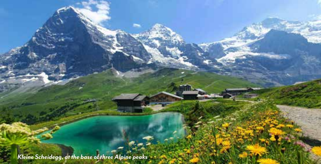
Kleine Scheidegg, at the base of three Alpine peaks

canal-lined Petite France district, where tanners, millers and fishermen once lived during the Middle Ages. Visit Notre Dame Cathedral, an exquisitely ornamented Gothic beauty. This evening, attend the Captain's Farewell Reception and Dinner. (B,L,R,D)