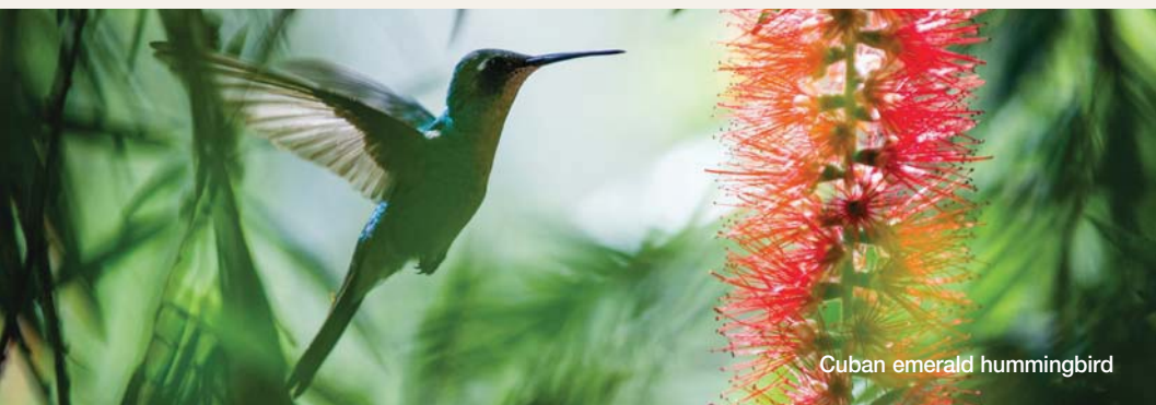
Cuban emerald hummingbird

Global Destinations Management Ltd. and Go Next Inc. are not responsible for injuries or losses resulting from any causes beyond their own respective and exclusive control or for the negligence of the other or any other suppliers or providers. Land accommodations, local transportation, and sightseeing are arranged and operated by Gray Line Miami, which may use other suppliers or providers to render the services. HOTEL AND SIGHTSEEING ARE SUBJECT TO CHANGE.