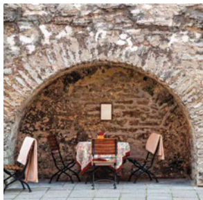
Old Town, Tallinn