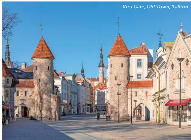
Viru Gate, Old Town, Tallinn