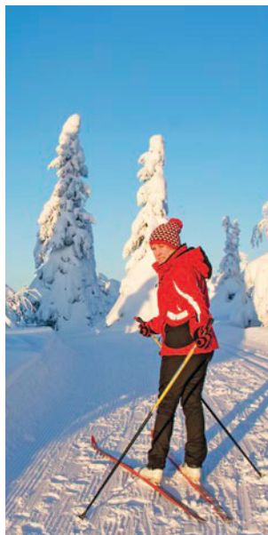
Exploring at Northern Lights Village