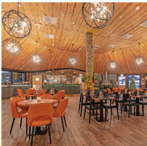
Restaurant, Northern Lights Village