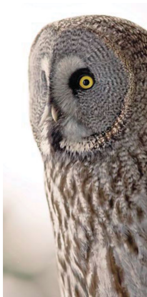
Great Grey Owl, Lapland