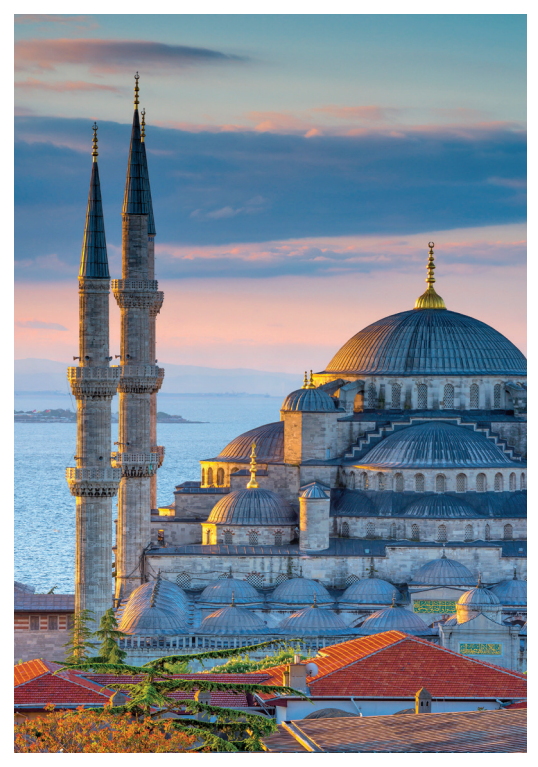
Istanbul's majestic Blue Mosque

feet into the Mediterranean. Returning to our hotel, this afternoon is at leisure. Tonight, we celebrate our Turkish adventure over a farewell dinner together. B,D