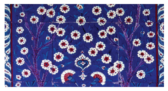
Exquisite Iznik tiles

Day 14: Antalya/Perge This morning we explore the ruins at Perge, an ancient Greek city once among the world's prettiest and most prosperous. We also visit the Duden Waterfalls, which tumble about 130