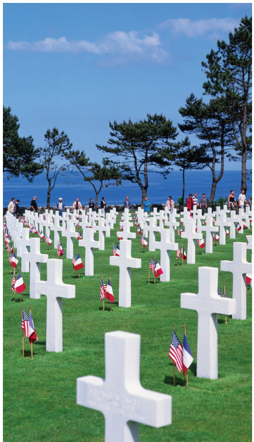
On Day 12, we visit the American Cemetery at Omaha Beach.