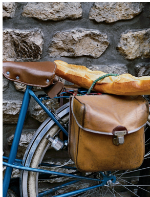
Typical French scene

Day 13: Crépon/Giverny/Paris This morning we visit the village of Giverny and the home and gardens of Impressionist artist Claude Monet. Here we see the familiar lily pond and wisteria-covered Japanese footbridge of Monet's paintings, as well as his home, now restored to its original design. Then we travel to Paris, reaching our hotel late afternoon. We are free for dinner on our own in this culinary capital. B