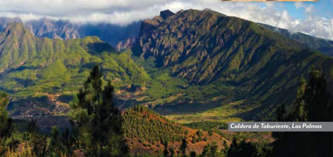
Caldera de Taburiente, Las Palmas