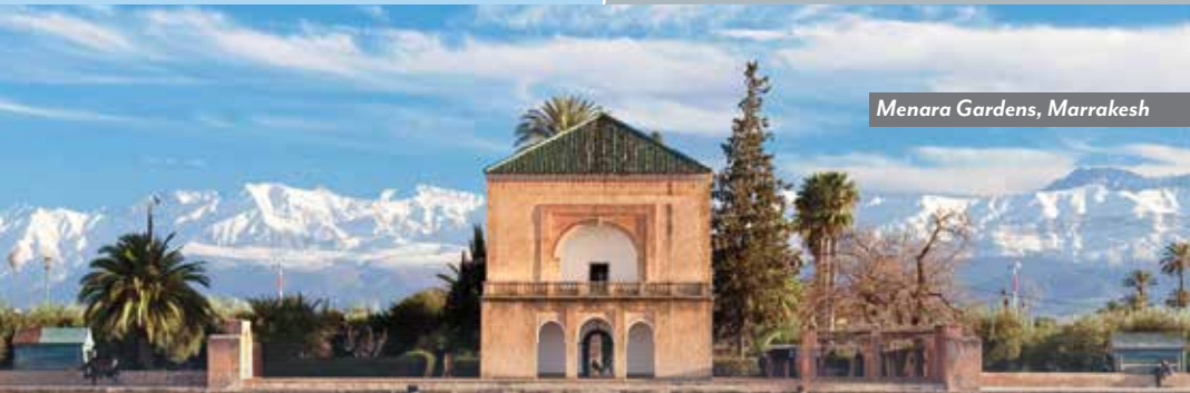
Menara Gardens, Marrakesh