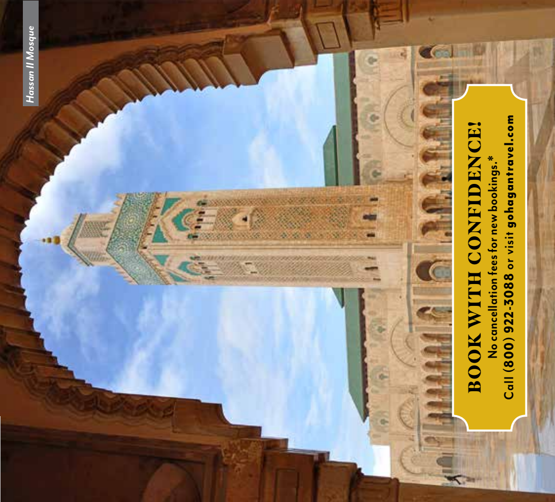
Hassan II Mosque