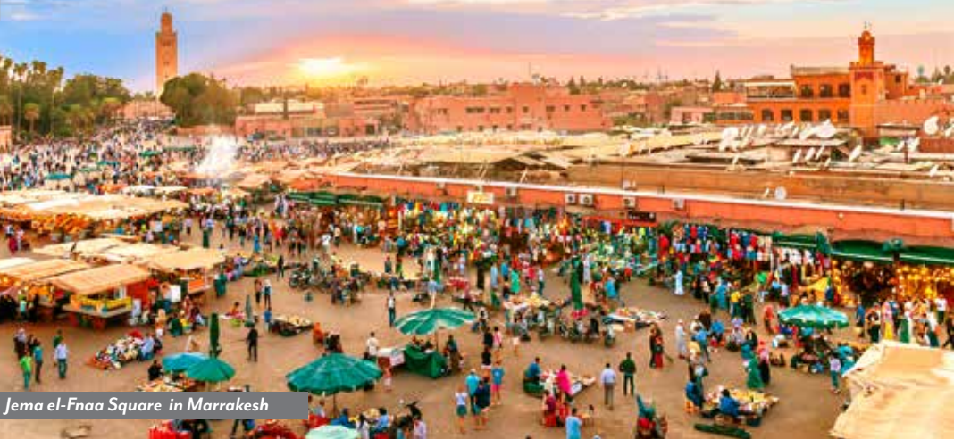
Jema el-Fnaa Square in Marrakesh