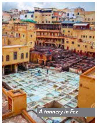
A tannery in Fez

Enjoy an afternoon at leisure to experience the captivating