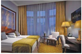
Art Deco Imperial Hotel | Prague, Czech Republic