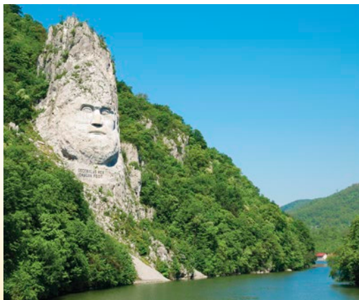
Decebalus stone sculpture, Iron Gate Gorge