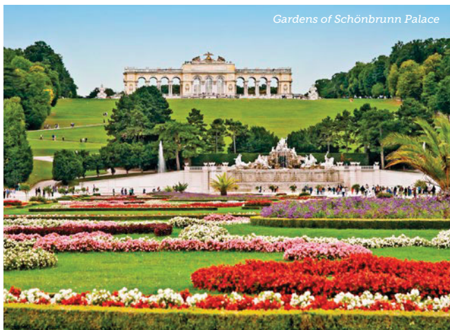
Gardens of Schönbrunn Palace