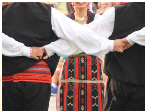
Serbian folk dancing