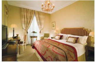
Sofia Hotel Balkan | Sofia, Bulgaria