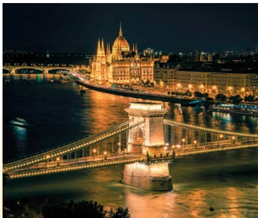
Budapest at night