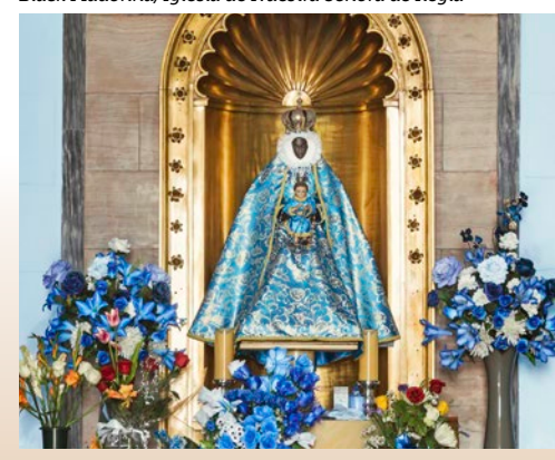
Black Madonna, Iglesia de Nuestra Señora de Regla

After lunch in Matanzas, visit the Sugar Mill Triunvirato to see the moving, 19th-century Monument to the Slaves' Rebellion.