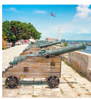
Cannons at fortification, Havana