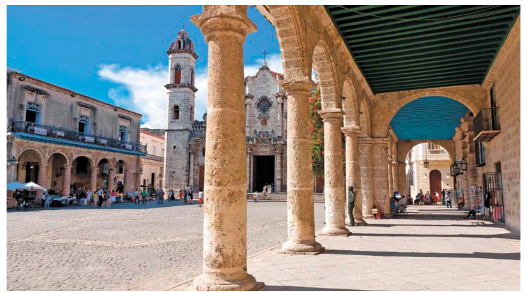
Plaza of the Cathedral, Old Havana