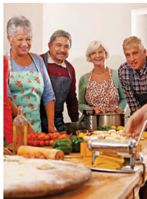
Piedmontese cooking class