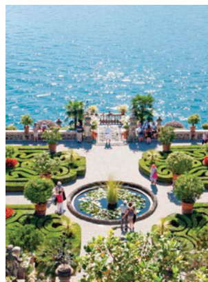
Isola Bella, Lake Maggiore