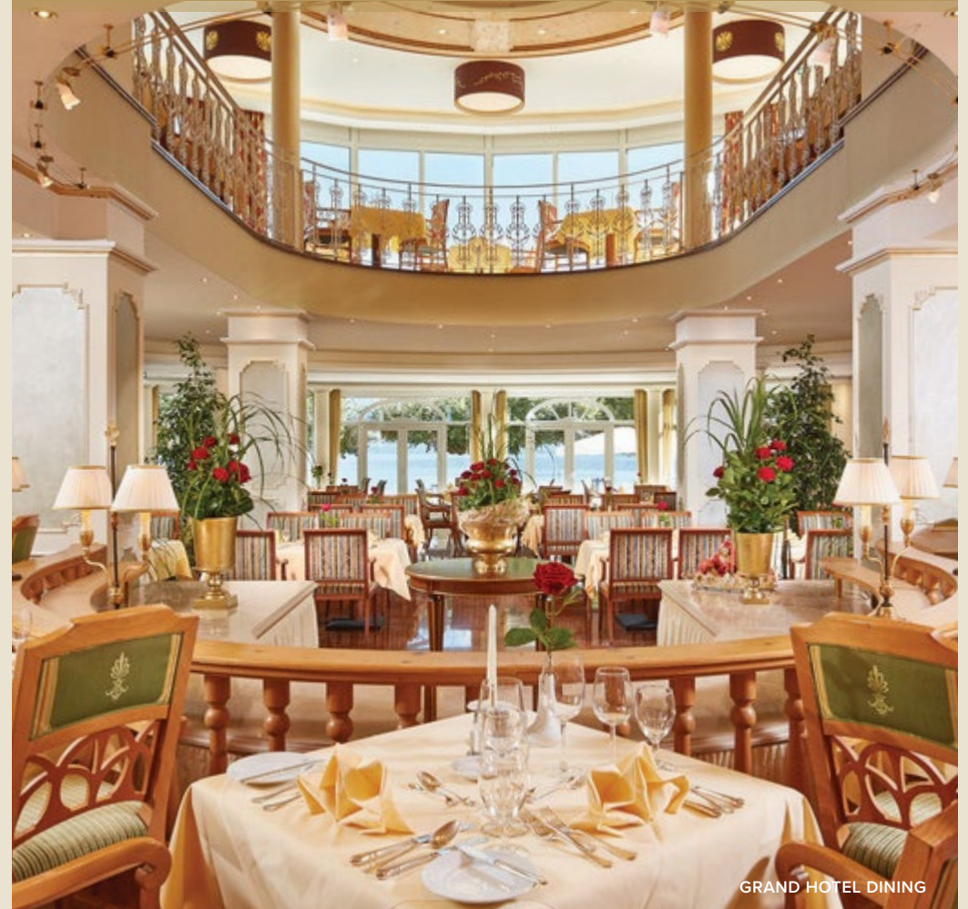
GRAND HOTEL DINING