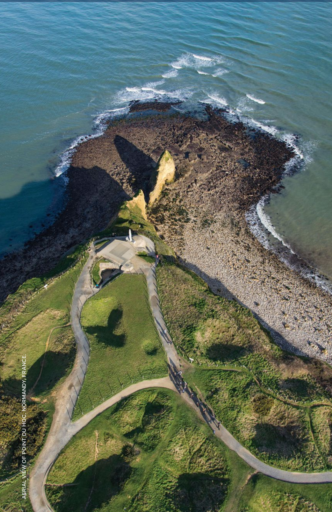
AERIAL VIEW OF POINT DU HOC, NORMANDY, FRANCE.