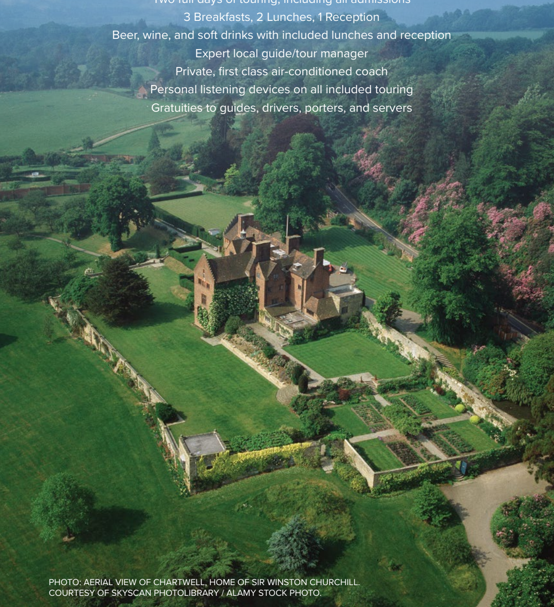
PHOTO: AERIAL VIEW OF CHARTWELL, HOME OF SIR WINSTON CHURCHILL. COURTESY OF SKYSCAN PHOTOLIBRARY / ALAMY STOCK PHOTO.