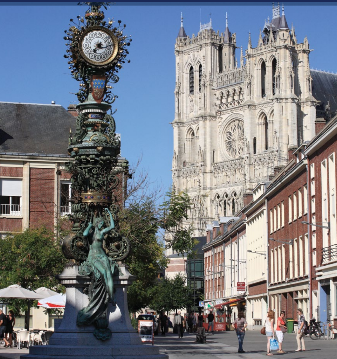
VIEW OF AMIENS DEWARTLY CLOCK AND THE CATHEDRAL OF OUR LADY OF AMIENS, AMIENS, FRANCE.