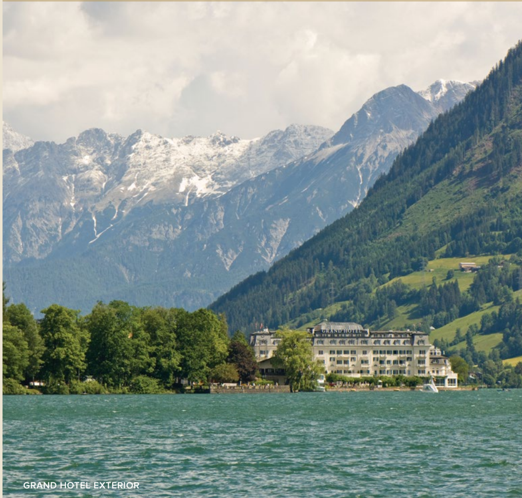
GRAND HOTEL EXTERIOR