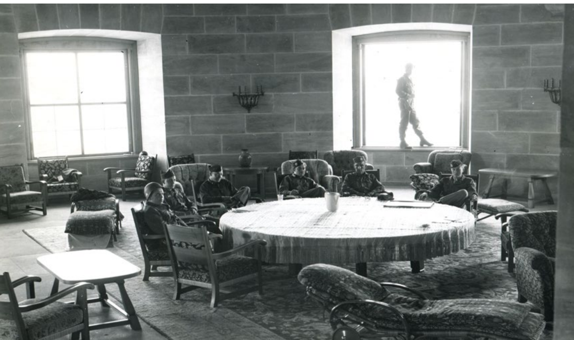
PHOTO: 101ST AIRBORNE AT HITLER’S EAGLE’S NEST.

Accommodations: Grand Hotel Zell Am See (B, D)