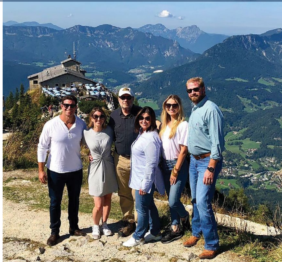
PHOTO: TOUR GUESTS AT HITLER’S EAGLE’S NEST, COURTESY OF THE NATIONAL WWII MUSEUM.