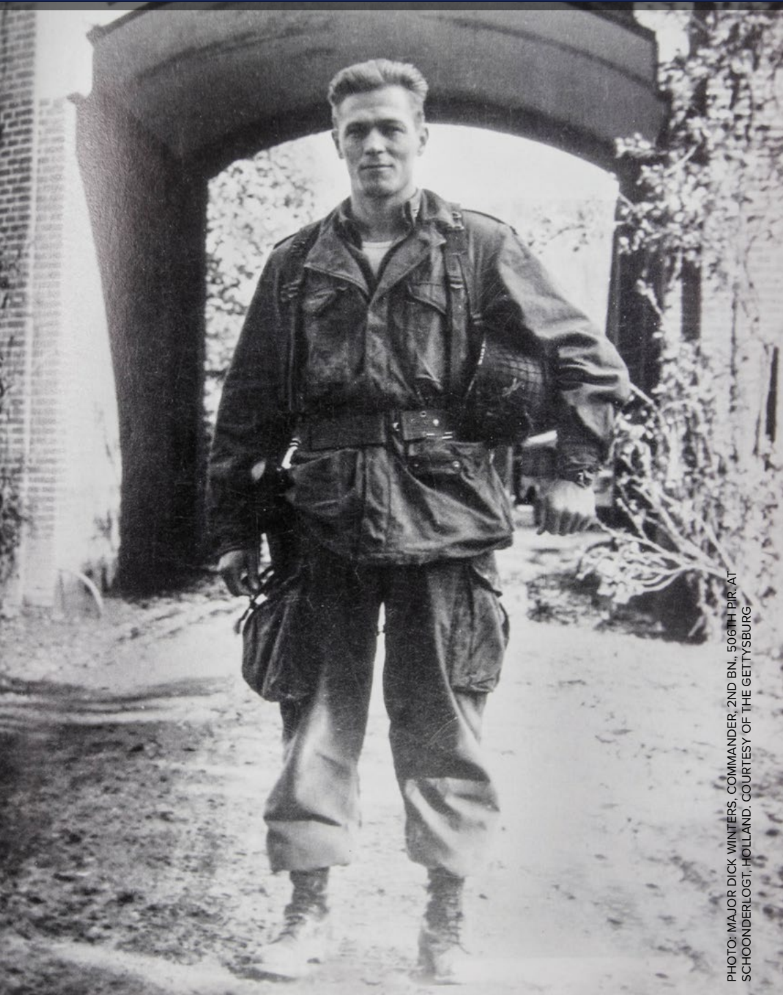
PHOTO: MAJOR DICK WINTERS, COMMANDER, 2ND BN., 506TH PIR, AT SCHOONDERLOGT, HOLLAND.

Distinguished Service Cross, Bronze Star with Oak Leaf Cluster and Purple Heart