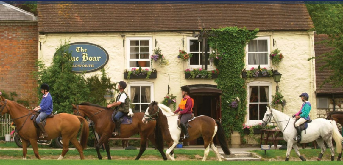
PHOTO: THE BLUE BOAR PUB IN THE VILLAGE OF ALDBOURNE, ENGLAND