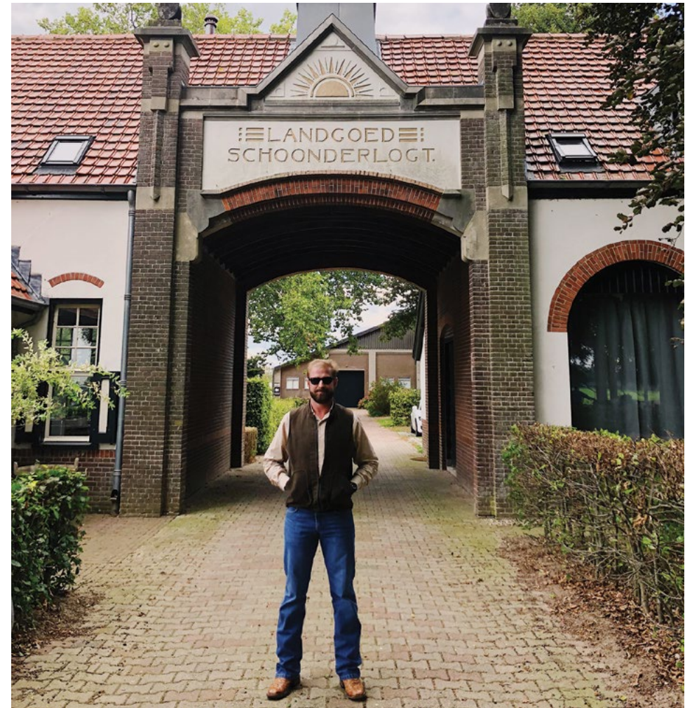
PHOTO: TOUR GUEST AT SCHOONDERLOGT, HOLLAND. COURTESY OF THE NATIONAL WWII MUSEUM.