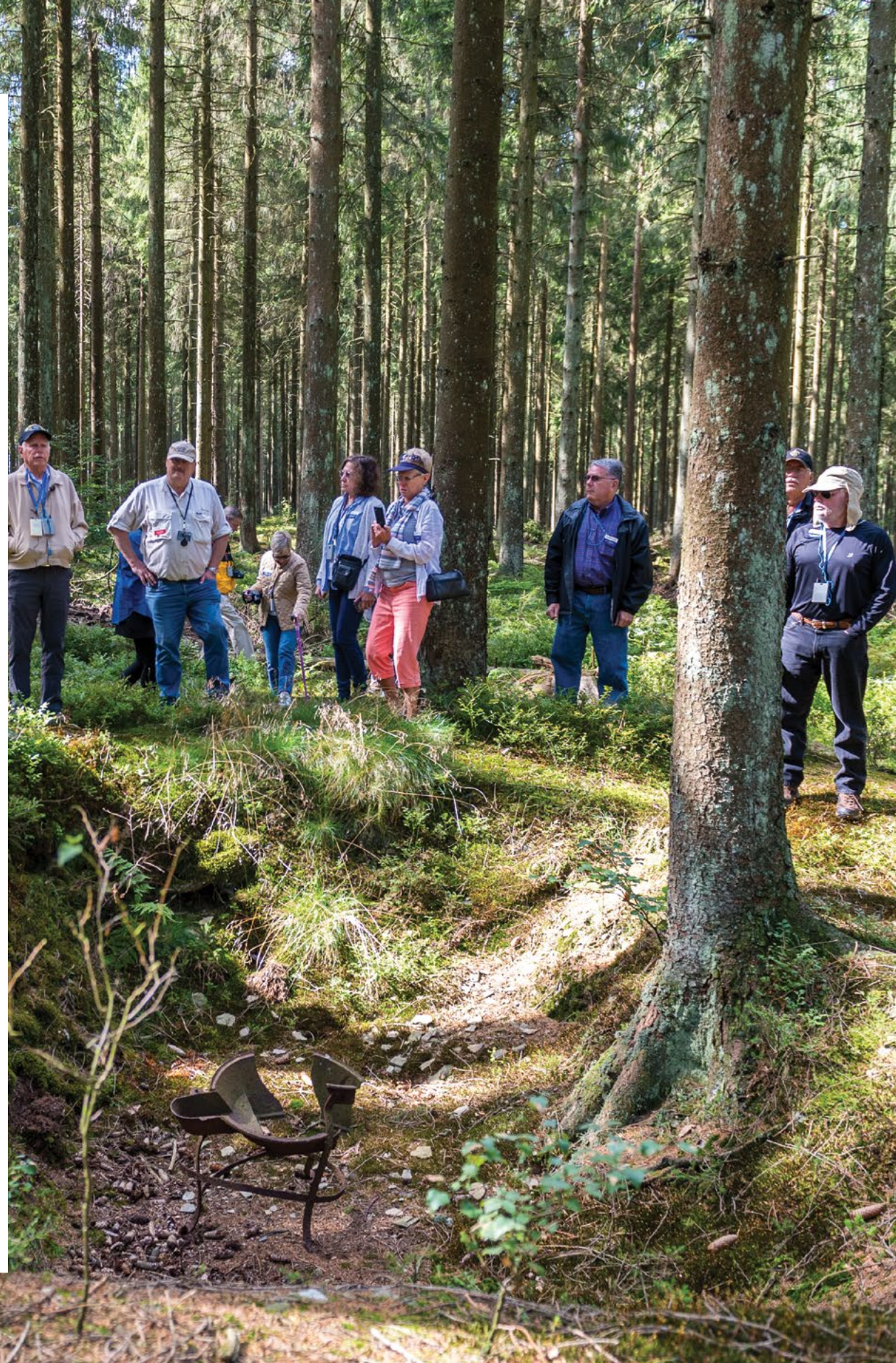
COVER PHOTO: AERIAL VIEW OF HITER'S EAGLES NEST. BACKGROUND PHOTO: TOUR GUESTS EXPLORE THE FOXHOLES DUG BY MEMBER OF EASY COMPANY DURING THE BATTLE OF THE BULGE. BOIS JACQUES FOREST, BELGIUM.