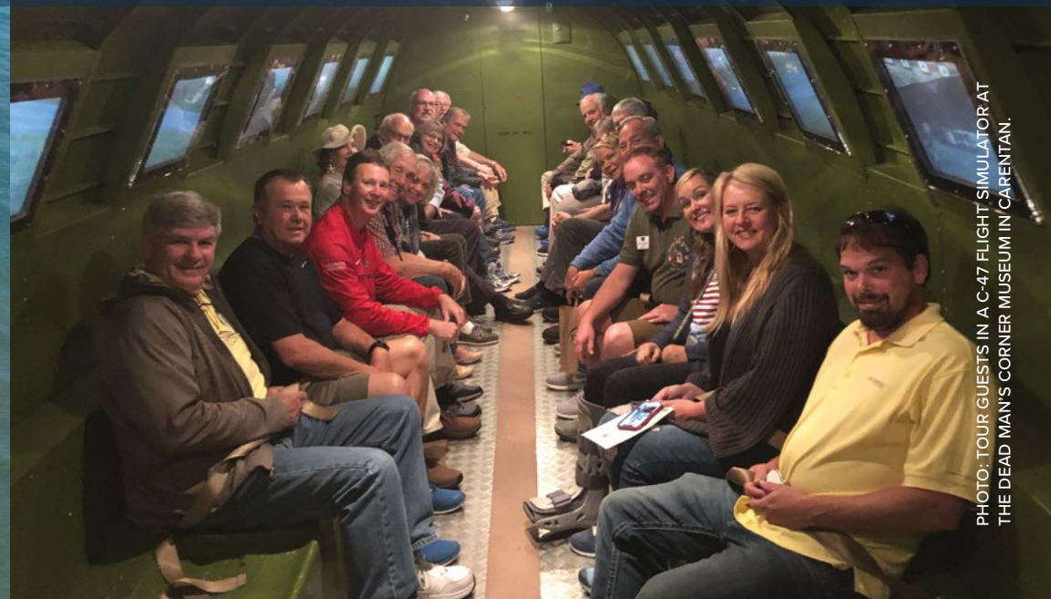
PHOTO: TOUR GUESTS IN A C-47 FLIGHT SIMULATOR AT THE DEAD MAN'S CORNER MUSEUM IN CARENTAN.