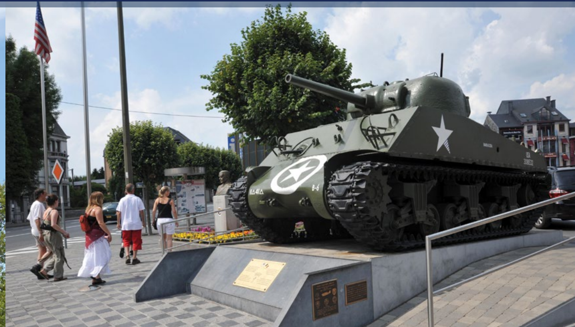
A SHERMAN TANK AND THE GENERAL MCAULIFFE MEMORIAL PICTURED ON THE MCAULIFFE SQUARE IN BASTOGNE, BELGIUM.